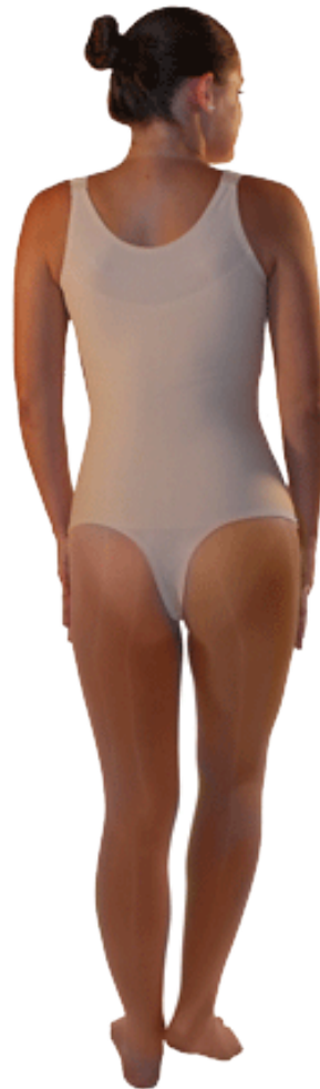
Full Body Thong-back