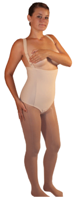
Abdomen Contour Thong